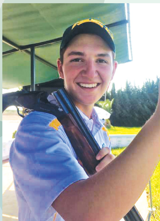
2016 WORLD UNIVERSAL TRENCH CHAMPION