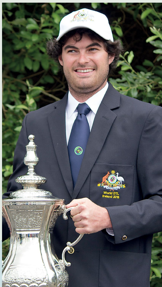
2016 WORLD OPEN DTL CHAMPION