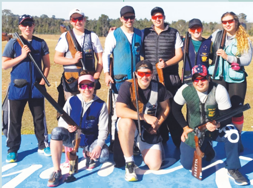
ISSF development athletes

The installation of "high traffic" matting behind the layouts will ensure a better surface for access around the layouts from shooters, shoot marshals, referees and scorers.