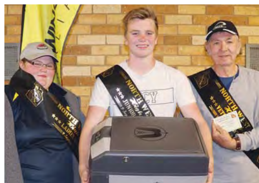
Ladies, Junior & Veteran High Guns