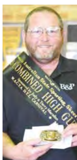
Combined HG P House