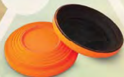
STANDARD FLASH - ORANGE