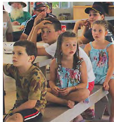
The young ones at presentations