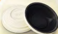
STANDARD - WHITE