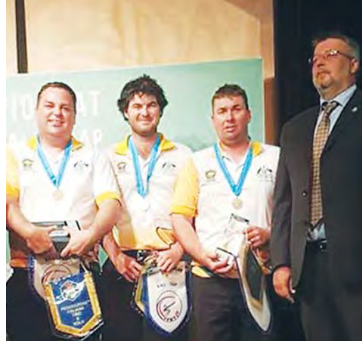
Senior team collecting Bronze