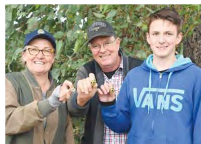
Blake Family State Team trifecta