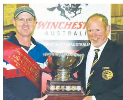
DB OA P Grainger