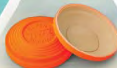
STANDARD NATURAL ORANGE