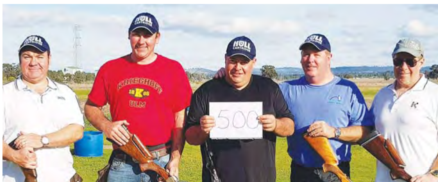
Frankston 5 man Team 500x500

At every nationals it's important to keep the show running and the great shoot management provided by the ACTA and specifically Sue Pim the shoot marshal for keeping the shoot moving but allowing for these shoot-offs to continue, and for the crowd to keep enjoying watching these amazing feats should be most highly commended and all of the skeet shooters are so very thankful for Sue's creativity around re-squading and keeping everything going.