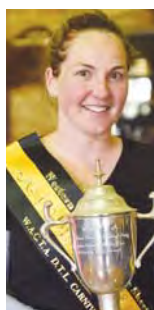
Combined Skt/DTL Ladies HG A Finn