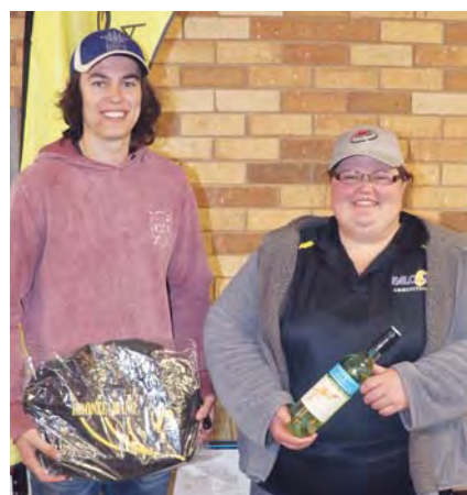
Event 3 Junior & Ladies