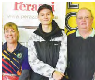
DB Points C Grade