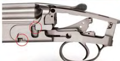
BOSS TYPE LOCKING SYSTEM