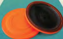
BATTUE - ORANGE