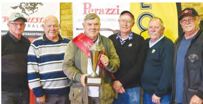
Trap Veteran Team