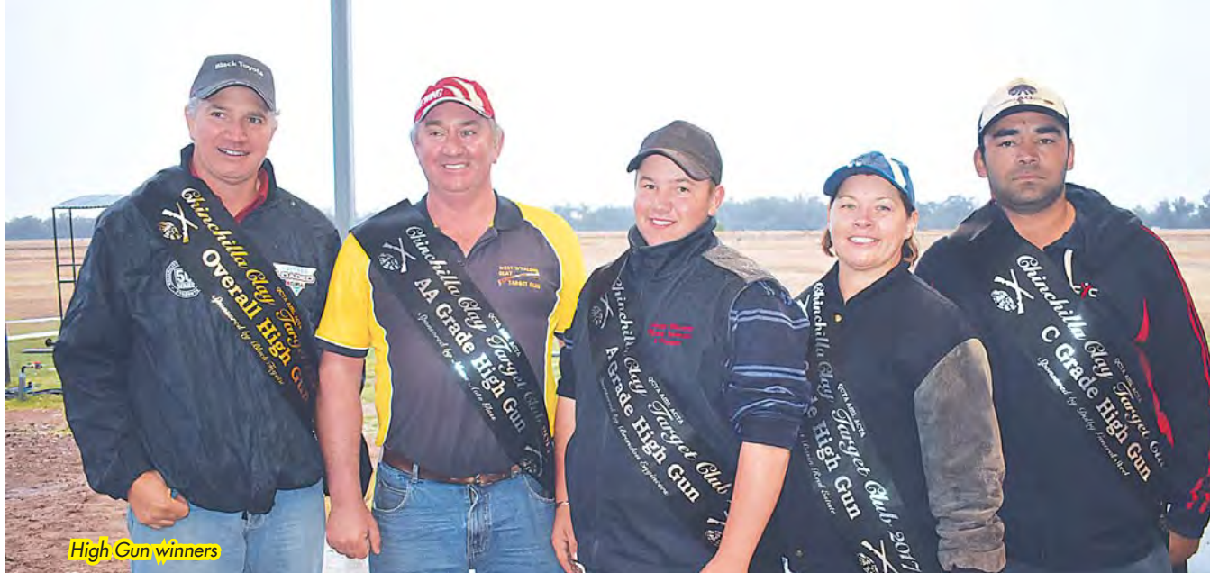
High Gun winners