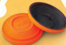
STANDARD - ORANGE