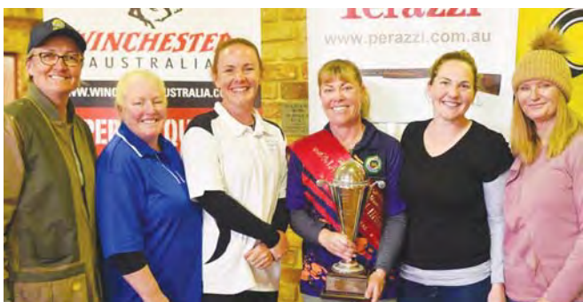
State Ladies Team