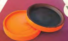
RABBIT - ORANGE