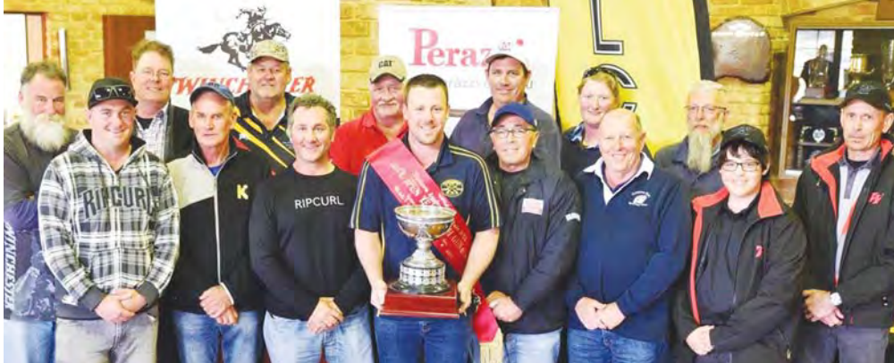
State Trap Team