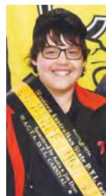
Junior HG W Freni-Lizzi