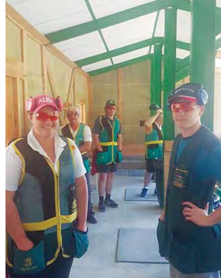
The strange layouts in Megeve where you virtually shoot inside a hut