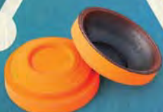
MINI - ORANGE