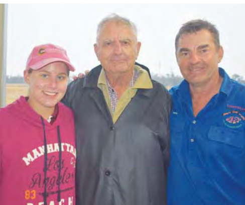
3 generations of the Collins family

Sunday morning and the wind was still there and everyone knew the much needed rain was to arrive but when.