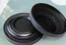
MIDI - BLACK