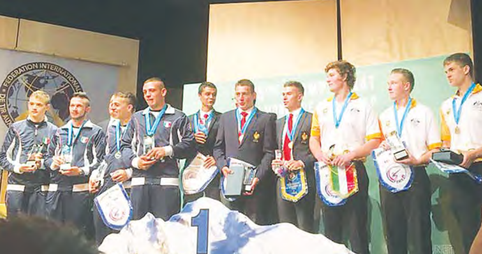
Junior team collecting Bronze