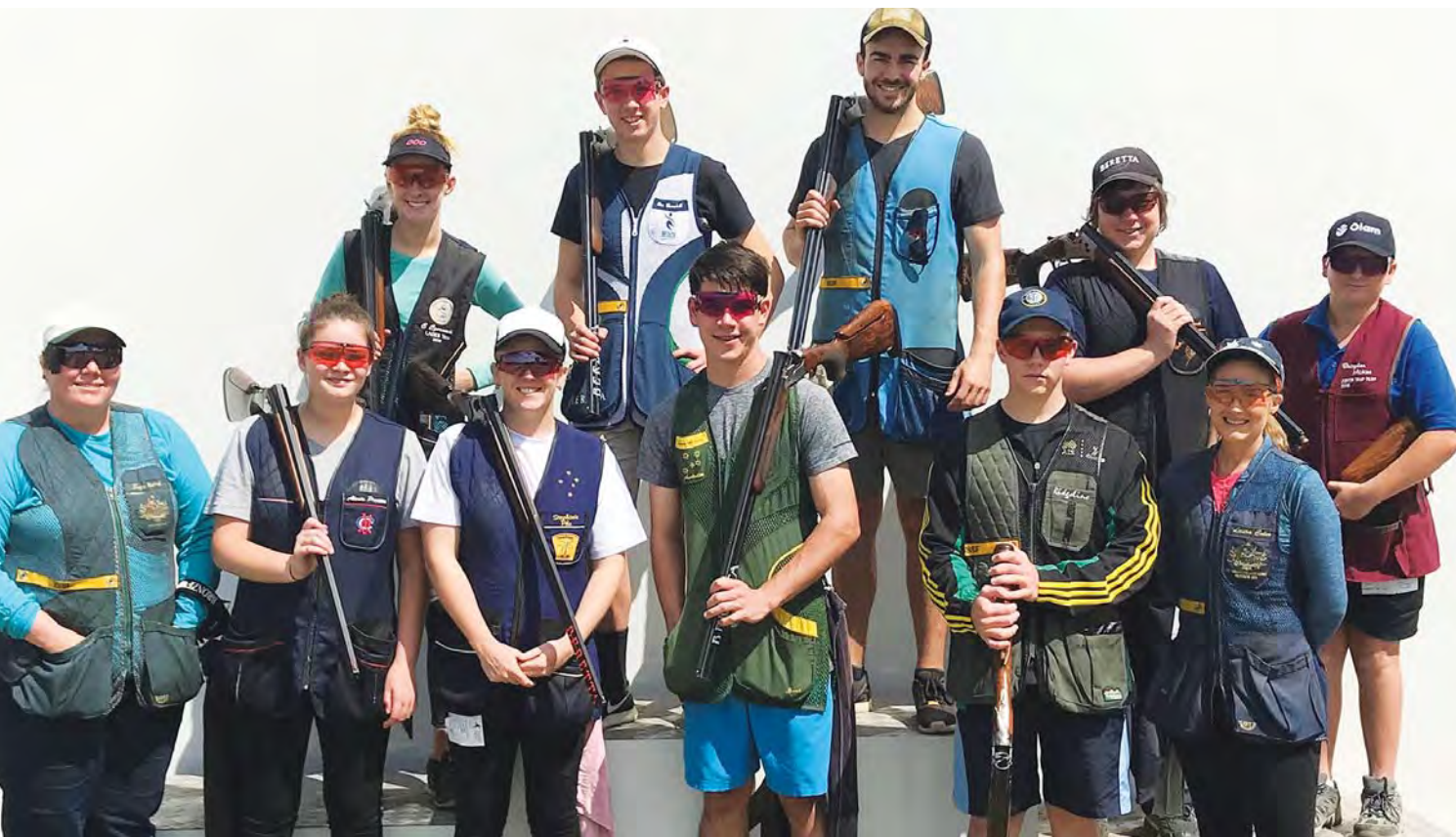
Camp attendees and coaches