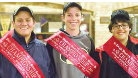
State Junior DR winners