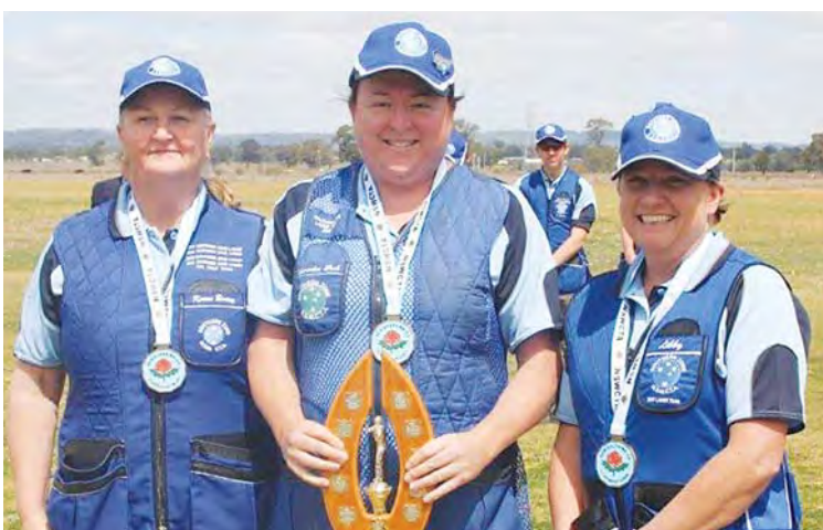
Southern Zone Ladies Team Riverina Zone Veterans Team