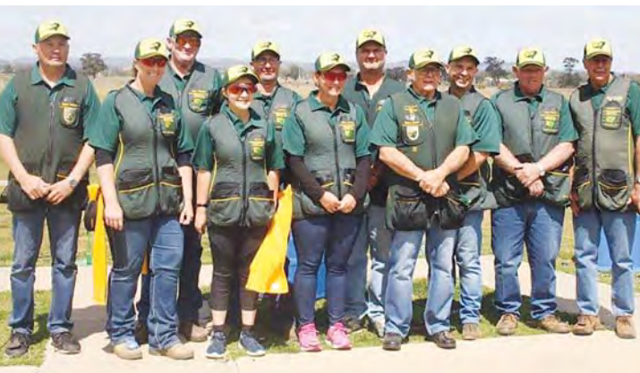
WZ Trap Teams for 2017