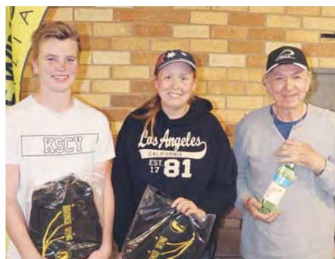
Event 2 Junior, Ladies & Veterans