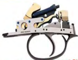
DETACHABLE TRIGGER MECHANISM