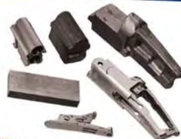
STEEL FORGED COMPONENTS