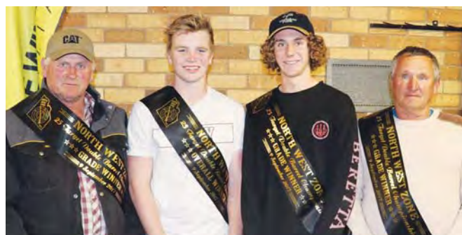
Event 1 grade winners