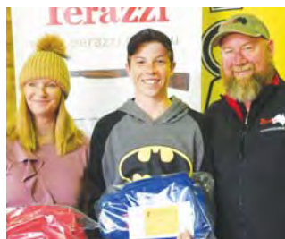
DB Points B Grade

Carnival once again. The score board was being carefully eyed off to see who was going to succeed in putting the scores together & taking out the State Double Barrel Points Score & the Roy Alexander Perpetual. But in the end there was only one perfect 150/150 & that