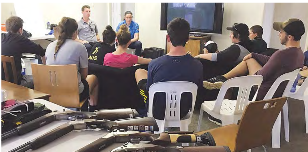
Condor Performance Sports Psychologists answering questions of the attendees