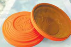
ECOSTAR LIGHT ORANGE

AUSTRALIA'S NUMBER ONE CHOICE IN CLAY TARGETS