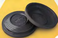
STANDARD - BLACK