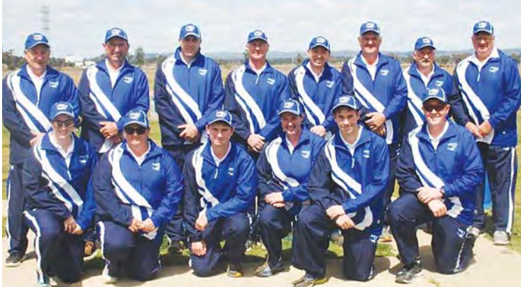
Riverina Zone Trap Teams for 2017