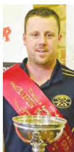
Open Team HG R Normington