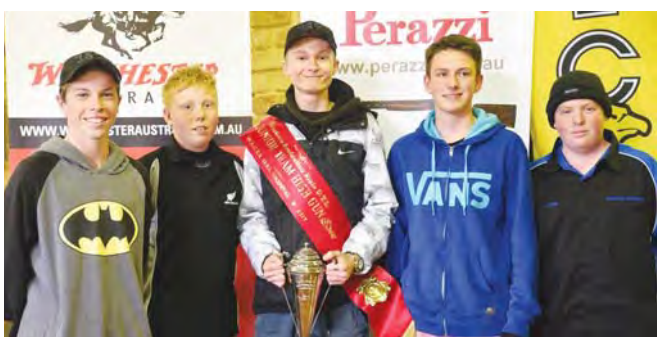
State Junior Team