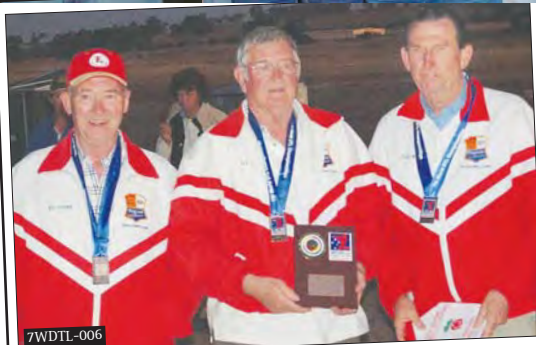
Veteran Team Bronze - England