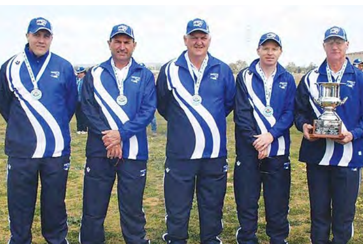
Riverina Zone Open Team Central Zone Junior Team