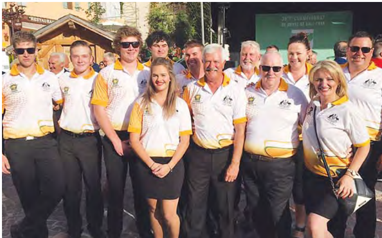
Australian Team at the Opening Ceremony

We also announced our team flag bearer for the opening ceremony to be held the following night. This went to our current Ladies World