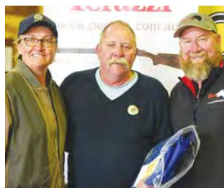
DB Points A Grade