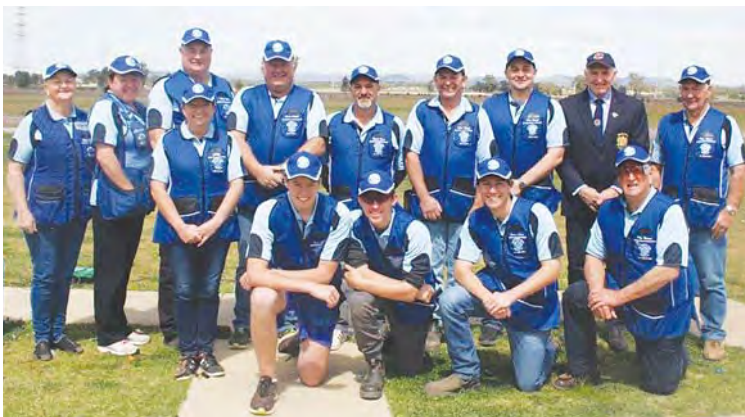
SZ Trap Teams for 2017