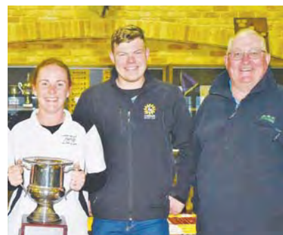
Zone Team Great Southern