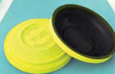
STANDARD - YELLOW