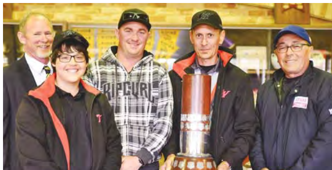
Katanning Bullet WAGC

At the completion of the State DTL Carnival there are two Combined High Guns recognising the three State Carnivals held in the domestic disciplines. The first is