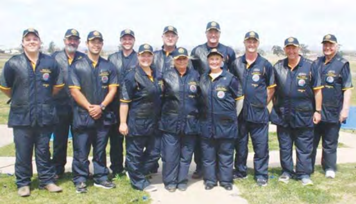
NZ Trap Teams for 2017