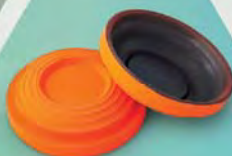
MIDI - ORANGE