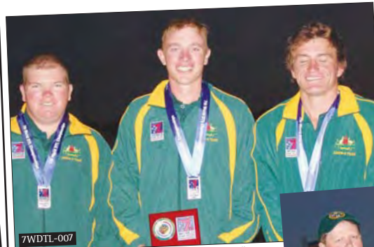
Junior Team Silver - Australia