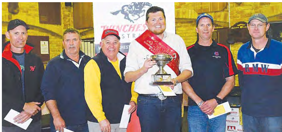
Below: State HC Winners