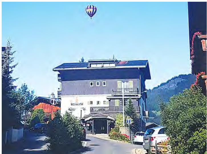
Home in Megeve Hotel au Coin du Feu

The range is located high up on a ski resort mountain at about 1700