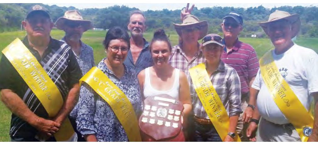
The winners on the day

With shooters from Yamba, Gold Coast & Kempsey travelling several hours, the club