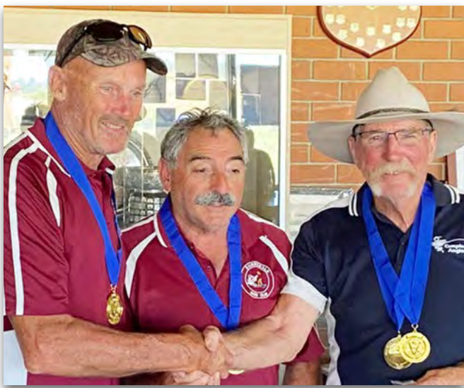
Veteran Shoulder to Shoulder Team