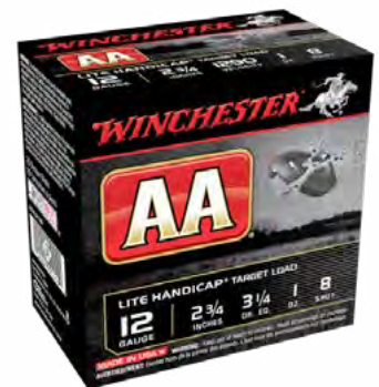
LITE HANDICAP 1290