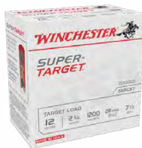
SUPER TARGET 1200&1290