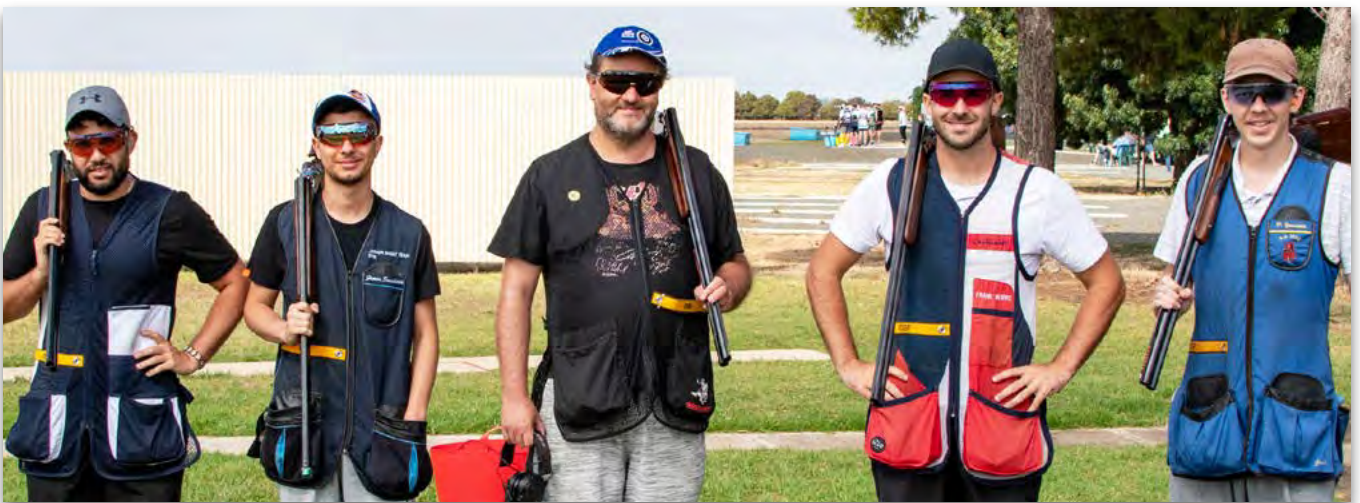
Squads looking relaxed before competing

The Shotgun World Championships National Team selection leaderboard can be found at https://shootingaustralia.org