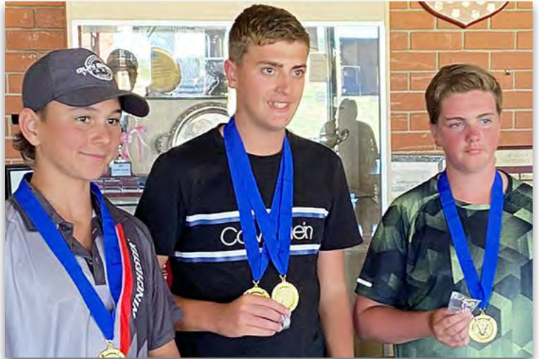
Junior Shoulder to Shoulder Team