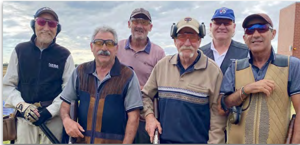
Victorian Veteran Postal Team