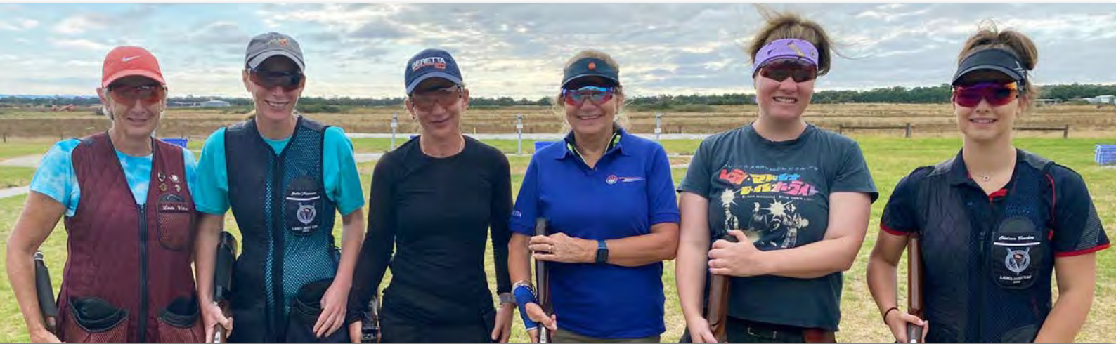
Victorian Ladies Postal Team

Teams and then those who also made the State Shoulder to Shoulder Teams. We look forward to watching you compete against the other States at the Nationals in Wagga Wagga later this year.