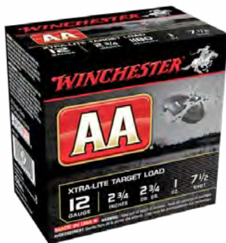
EXTRA LITE 1180