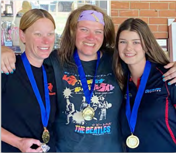
Ladies Shoulder to Shoulder Team