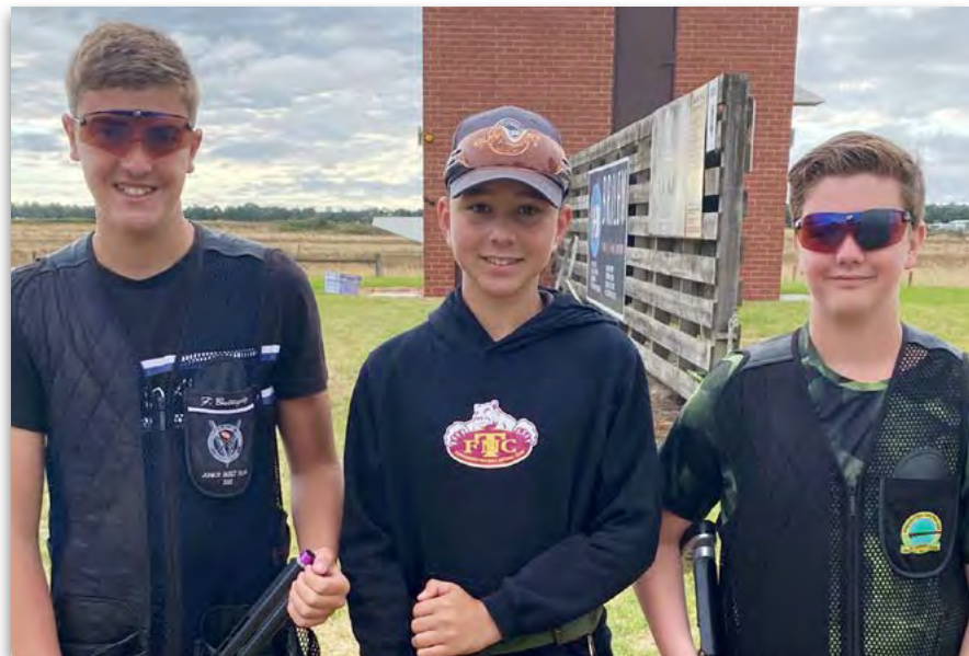
Victorian Junior Postal Team