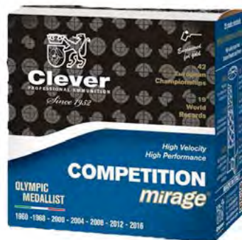
CLEVER COMPETITION 1250