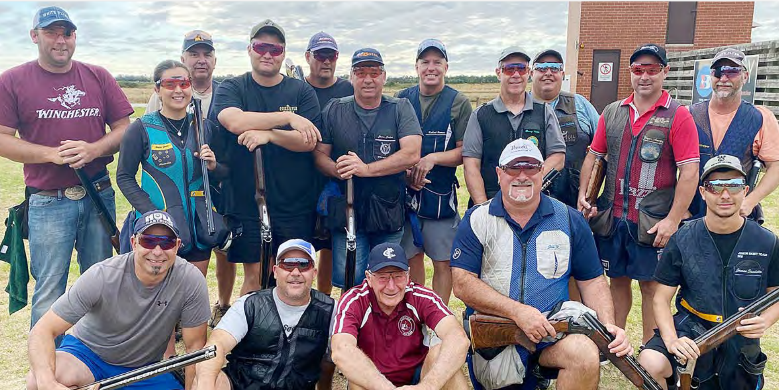
Victorian Open Postal Team