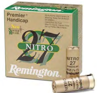
REMINGTON- NITRO 1290