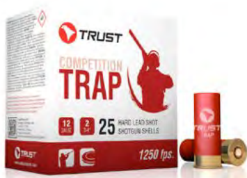
TRUST COMPETITION 1250