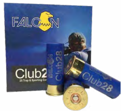
CLUB 28 1250