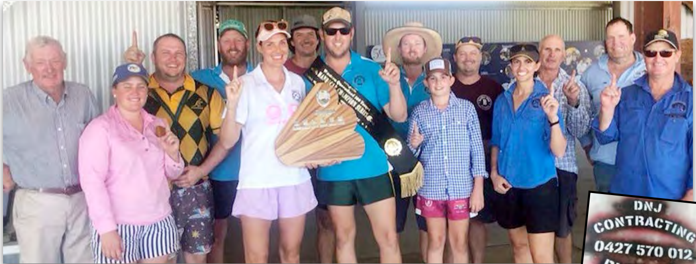
Thank you to our club hosts for a great weekend