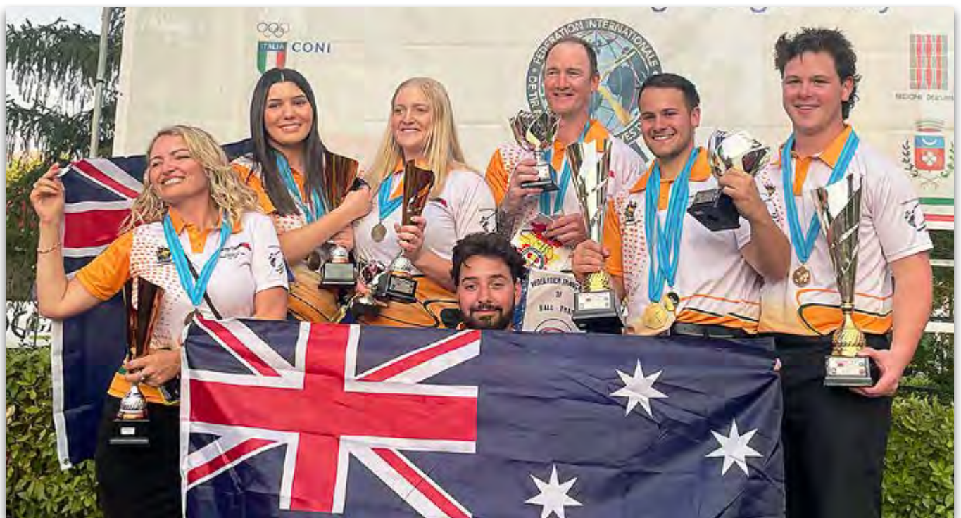
Aussie winning medallists after the awards ceremony.