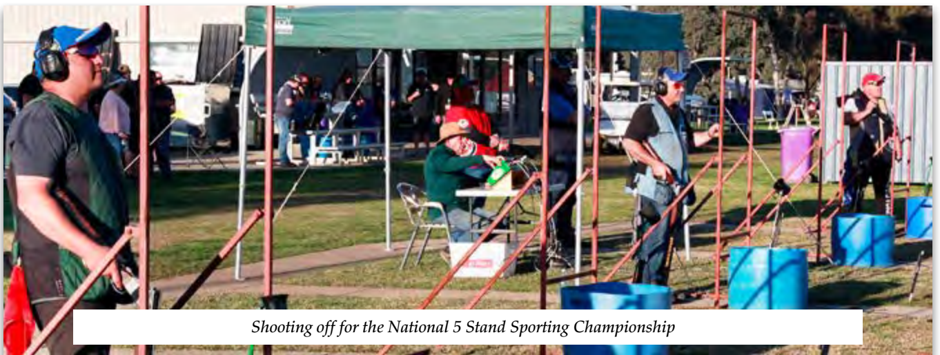
Shooting off for the National 5 Stand Sporting Championship