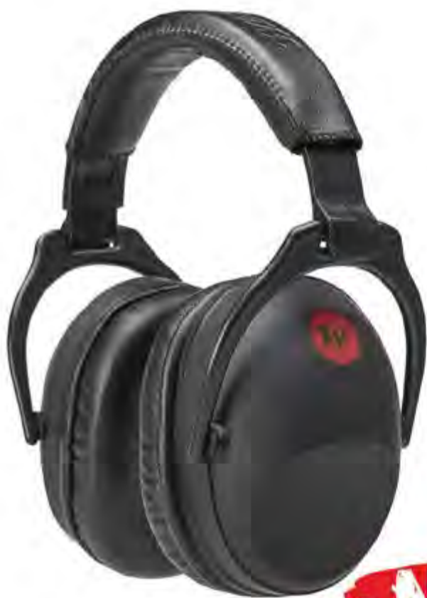
Winchester Hearpro Oregon Passive Black Earmuffs

Winchester Hearpro Dakota Active Black Earmuffs feature a jack, volume control by potentiometer and Activ system that enables sound suppression and amplification when required.