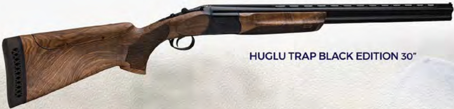
HUGLU TRAP BLACK EDITION 30"

The Huglu Trap Black Edition is the perfect shotgun for competition and recreational shooting.