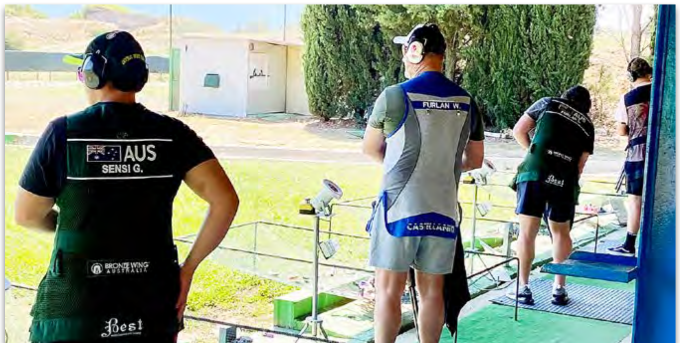
Some of the Aussies getting practice in at Umbriaverde

Day 1 of competition and all of the Aussie team were in the afternoon session starting at 1pm so we were all able to have a sleep-in and easy morning before it was our turn to shoot. Marco and Walter though were in the AM session so a few of us watched them shoot. Each day would alternate so Day 2 we started at 10am, Day 3 back to 1pm and the last day another 10am start with 50 targets shot each day.