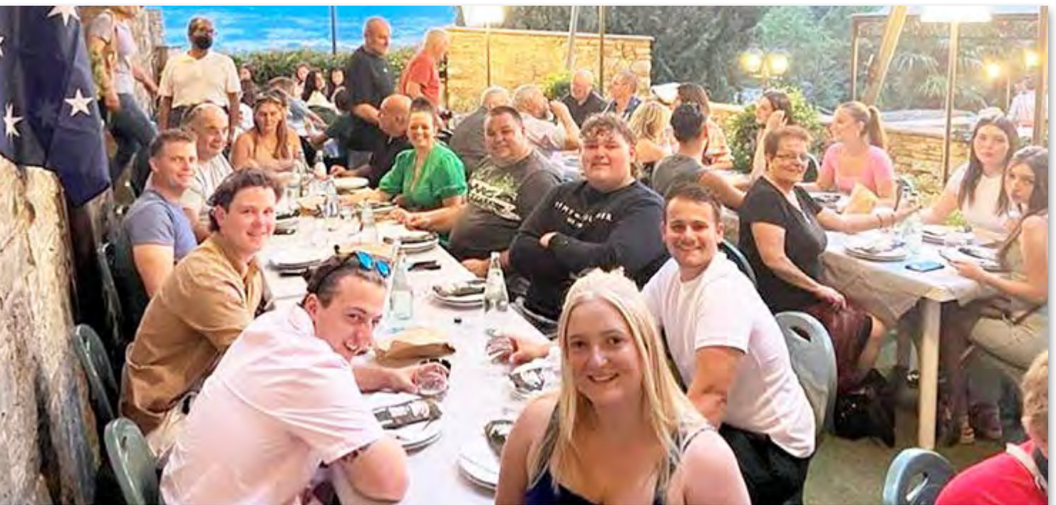
Team dinner in the town of Todi at Ristorante Cavour

Tuesday night we had our official team dinner in the town of Todi at "Ristorante Cavour", a lovely restaurant in the heart of the town with some even spectacular views. A bus was arranged to take us to the town which was also hosting a music festival that night so the town was packed