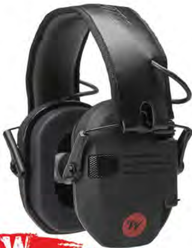
Winchester Hearpro Dakota Active Black Earmuffs