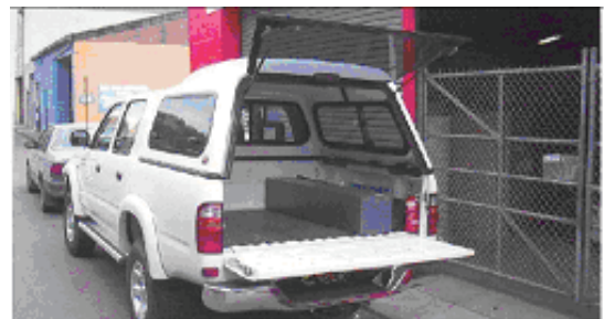
Doors must be locked while the vehicle is unattended and keys must not be left in the vehicle