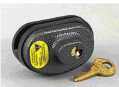
Examples of trigger locks