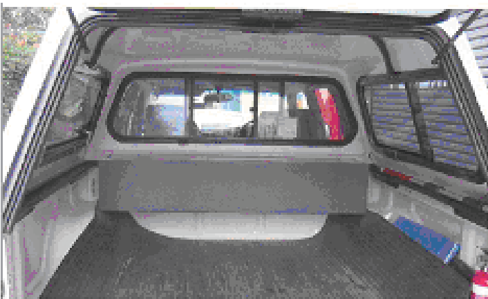
Safe bolted to structural parts of the vehicle

Leaving the firearms unattended overnight or for extended periods of time without added security or locking the vehicle in a secure compound would not be considered to be reasonable precautions to prevent loss or theft.